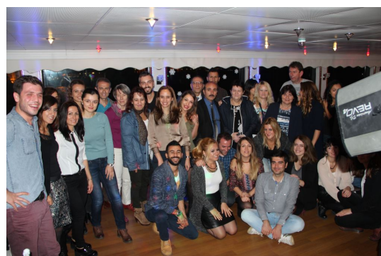
(d) On the boat on Bosphorus