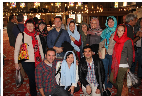
(b) In the Blue Mosque