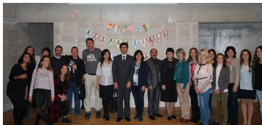
(a) After the welcome ceremony